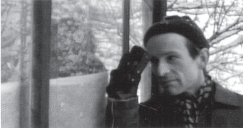
Figure 2. Transcending the Intentional: Video Caption from Tom Tykwer's Winterschläfer (1997).