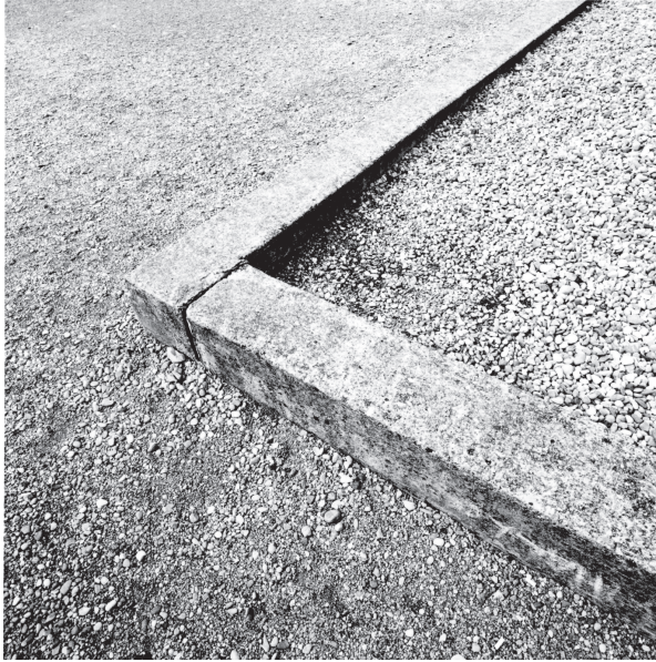
Figure 6. Alan Cohen, "Dachau, 1992."