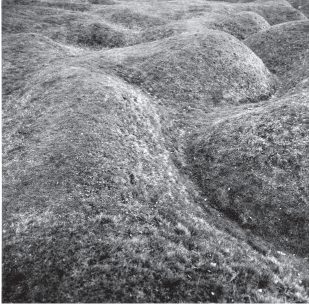
Figure 4. Alan Cohen, "Somme, 1998:"