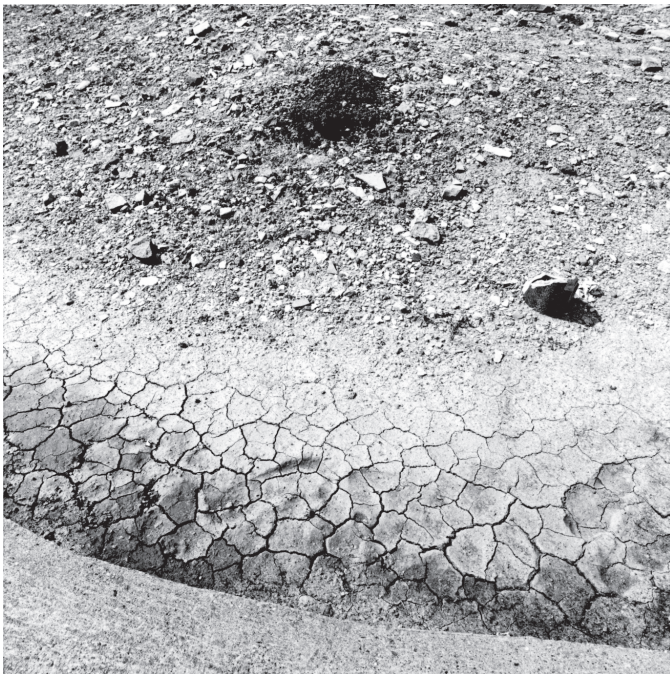
Figure 7. Alan Cohen, "Buchenwald, 1994."