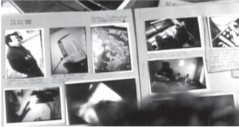
Figure 3. Images, Inscriptions, Narratives: Video Caption from Tom Tykwer's Winterschläfer (1997).

Rene unfetters himself from the uncanny dominance of the past over his present, of death over life.