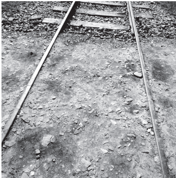
Figure 10. Alan Cohen, "Auschwitz-Birkenau, 1994."

Cohen's On European Ground is part of a project that continually resituates and re-revisions the symptomatic expressions of historical traumas. Its aim is neither to simply reenact nor to transcend traumatic residues. Instead, by reiterating and reframing the signs of traumatic rup-