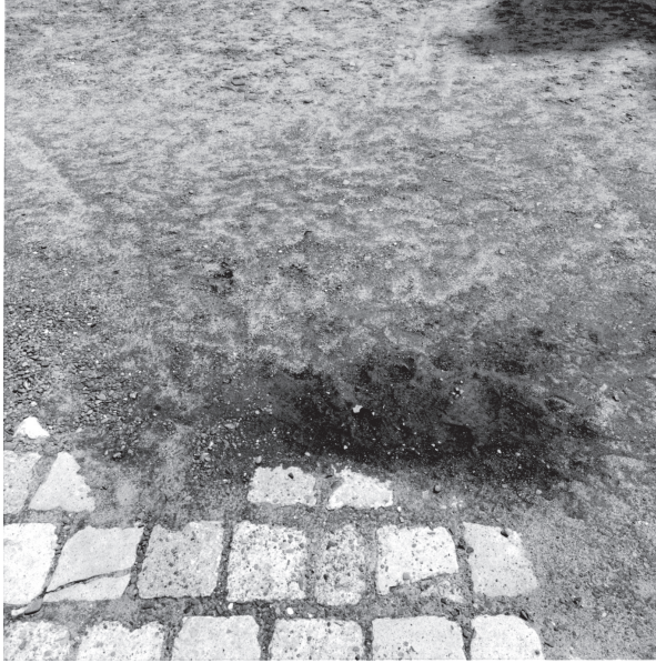
Figure 8. Alan Cohen, "Auschwitz, 1994."