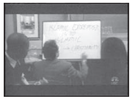
Figure 2. Josh teaches students about Islamic fundamentalism, The West Wing , October 3, 2001.

In this regard, the episode uses historical pedagogy to solidify American national unity against the "enemy" rather than to encourage any real engagement with Islam, the ethics of U.S. international policy, or the consequences of the then-impending U.S. bomb strikes. Moreover, because the episode's teach-in lectures are encompassed within a more overarching melodramatic rescue narrative (the terrorist bomb threat in the White House), all of the lessons the students (and by proxy, the audience) learn are contained within a narrative about U.S. public safety. In other words, according to the logic of this rescue narrative, we learn about the "other" only for instrumental reasons—our own national security.