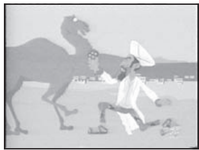
Figure 5. South Park, "Osama Bin Laden Has Farty Pants," November 7, 2001.