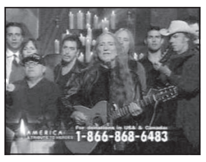
Figure 4. The celebrity anthem on America: A Tribute to Heroes , September 21, 2001.