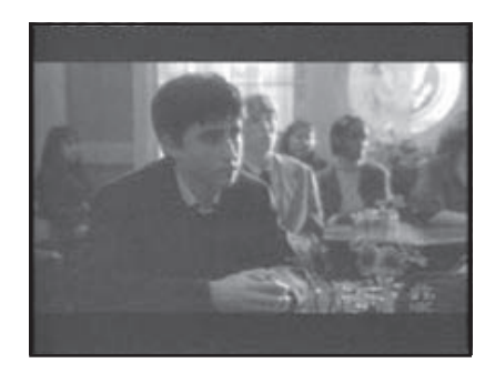
Figure 1. High school students trapped in the White House, The West Wing , October 3, 2001.